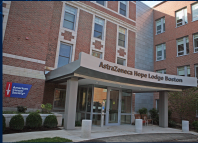
AstraZeneca Hope Lodge, Boston, MA

CEOs AGAINST CANCER Leading the way in fighting cancer